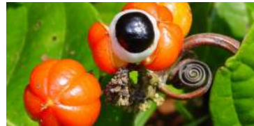
The Warana plant. "Warana" is the Sateré-Mawé word for guarana

indigenous peoples thus decided to initiate trade arrangements that respected their organisational set-up and their community. The Sateré-Mawé people consider themselves the « custodians of in situ warana genetic resources ». This emblematic plant is a powerful physical and mental stimulant. Guayapi has been commercialising warana for over twenty years through shops selling natural organic and fair trade products both in France and abroad. .