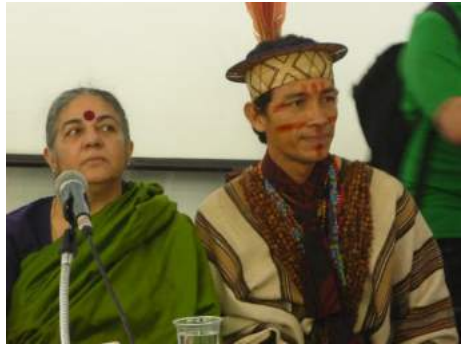
Second International Conference to Tackle Biopiracy (June 2012, Rio de Janeiro, Brazil)

The First International Conference to Tackle Biopiracy was held at the Assemblée Nationale in Paris, France, in June 2009. This was attended by a large number of subject-matter experts, who came together to define the concept of biopiracy, learn more about biopiracy practices and put forward viable alternatives.