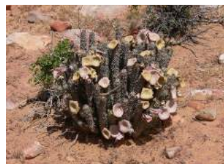
Hoodia is a well-known natural thirst and appetite suppressant. The appetite suppressant properties of hoodia are potentially of great value to the pharmaceutical market.

Benefit sharing was also at the centre of the hoodia biopiracy case. Hoodia is a cactus traditionally recognised and used by the San communities in South Africa as an appetite and thirst suppressant. The plant's relevant active ingredient was patented by a South African institute that had signed a benefit sharing contract with the San people. However, a range of hoodia -based products have since been commercialised by Swiss, German and French companies that have signed no agreement or benefit-sharing contract with the San population, the rights holders of the traditional knowledge.