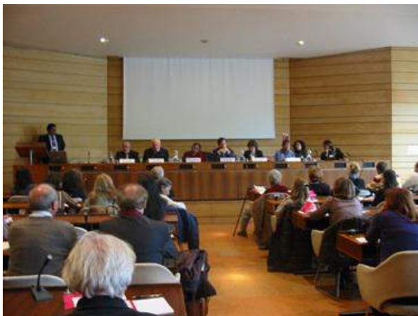
First International Conference to Tackle Biopiracy, held at the Assemblée Nationale (June 2009, Paris - France)

The present-day erosion of the world's biodiversity is creating an unprecedented crisis, one which is being exacerbated by the theft of indigenous knowledge of genetic resources. Biopiracy is becoming increasingly common around the world, posing a threat not only to local farmers' grain and seed stores but also to indigenous peoples' medicine stocks. Traditional indigenous knowledge is highly coveted,