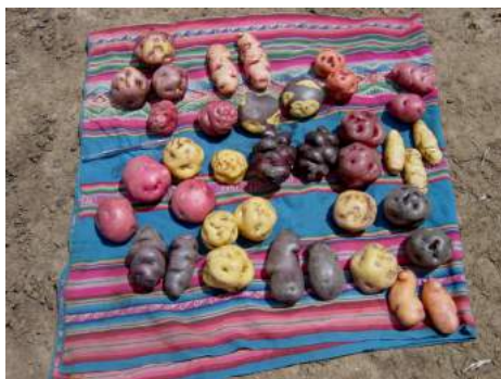
Examples of the different varieties of potato grown in the Potato Park, PISAQ Cusco, Peru

Bio-cultural community protocols provide a tool for sharing knowledge, not only within the indigenous community itself, but also with other communities affected. These protocols provide a link between all legislation, from local through to international laws. In addition, Krystyna Swiderska explained that the term "bio-cultural" has been used for a reason. It essentially emphasises the fact that there is an interdependent relationship between traditional knowledge and genetic resources; an interdependence that the Nagoya Protocol fails to fully recognise. Bio-cultural community protocols thus make it possible to both safeguard and strengthen indigenous communities' rights and their direct link with biodiversity.