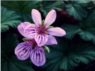
Pelargonium is used in traditional medicine. The roots of the plant are used to treat a range of respiratory infections.

François Meienberg concluded by saying that: « The Nagoya Protocol is particularly important and requires effective domestic legislation to be set up in order to put an end to the illegal sale of products. We not only need to look at patents but we should also review the products that have already been commercialised ».