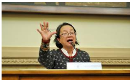
Victoria Tauli-Corpuz © Karine Boudart